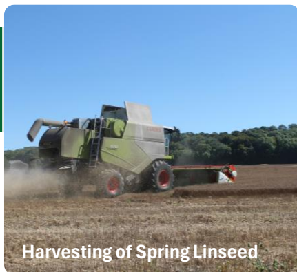
Harvesting of Spring Linseed